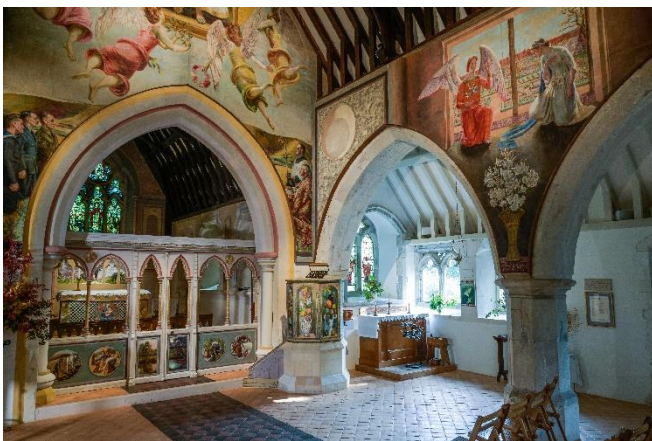
Winner – St Michael and All Angels Church in Berwick