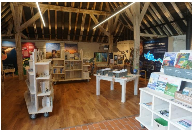
Winner – The refurbished visitor centre at Seven Sisters

For a full list of all the winners go to www.sussexheritagetrust.org.uk