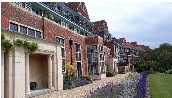
Winner - King Edward VII Estate near Midhurst